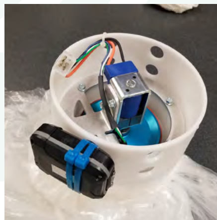
Weather Balloon's Payload

in the event you find one of their weather balloons, you should mail it back to them via the attached envelope and pre-paid postage. Unfortunately, there does not appear to be such a package attached to the balloon found in Trumann, just a GPS transponder (labeled "16") with a dead battery and little else. It is possible part of the balloon's payload was lost along the way.